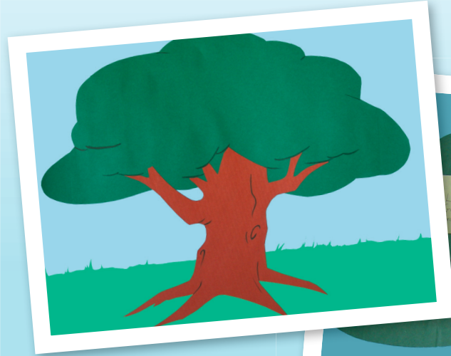
An 'Ecotree' in progress!